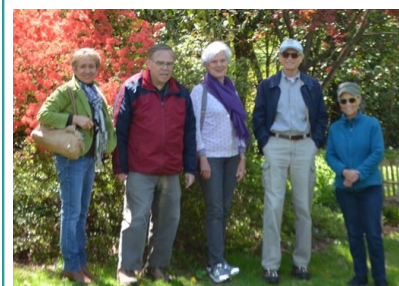
Touring McCrillis Garden