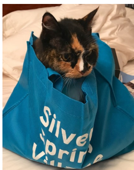
Showing the Village colors— photo by Tony Sarmiento.