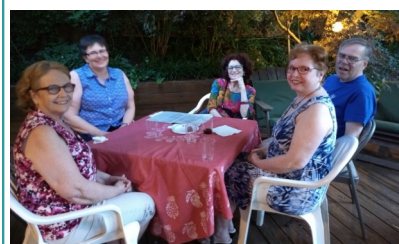
Enjoying a patio party