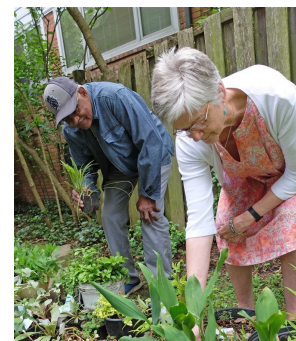
Finding possibilities at the annual plant swap

Silver Spring Village is a nonprofit membership organization started in 2013 to help older residents living in or near zip code 20910. We strive to enable our members to stay engaged in their community and continue to live at home with support from neighbors and friends.