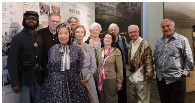
Learning about the Civil War with re-enactors and Village members

Village members also viewed the nearby African American Civil War Memorial. The rousing success of our longest field trip to date bodes well for future excursions.