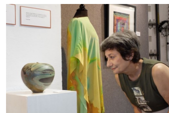
Visiting the Waverly Art Gallery

Did you know that being social can be good for your health? By that measure, Village members are a healthy lot! This past 2 months we have hiked, swapped plants, seen plays and movies, read books, been to great local restaurants, played games, painted, knitted, played games, celebrated birthdays and volunteers, and discussed books, current events, poems, and philosophy. See page 4 for what we are doing the rest of the summer. Not a member, but want to try us out? Contact us—see bottom of page.