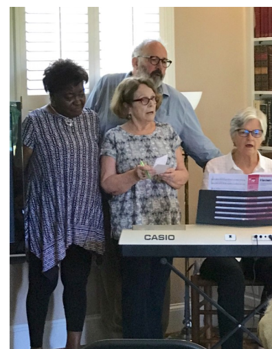
Four singers