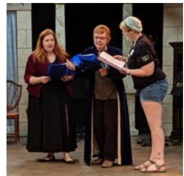
"Double, double, toil and trouble/ Fire burn and cauldron bubble"—lines from William Shakespeare's Macbeth