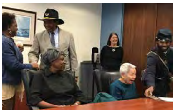
Learning about the role of African Americans in the Civil War