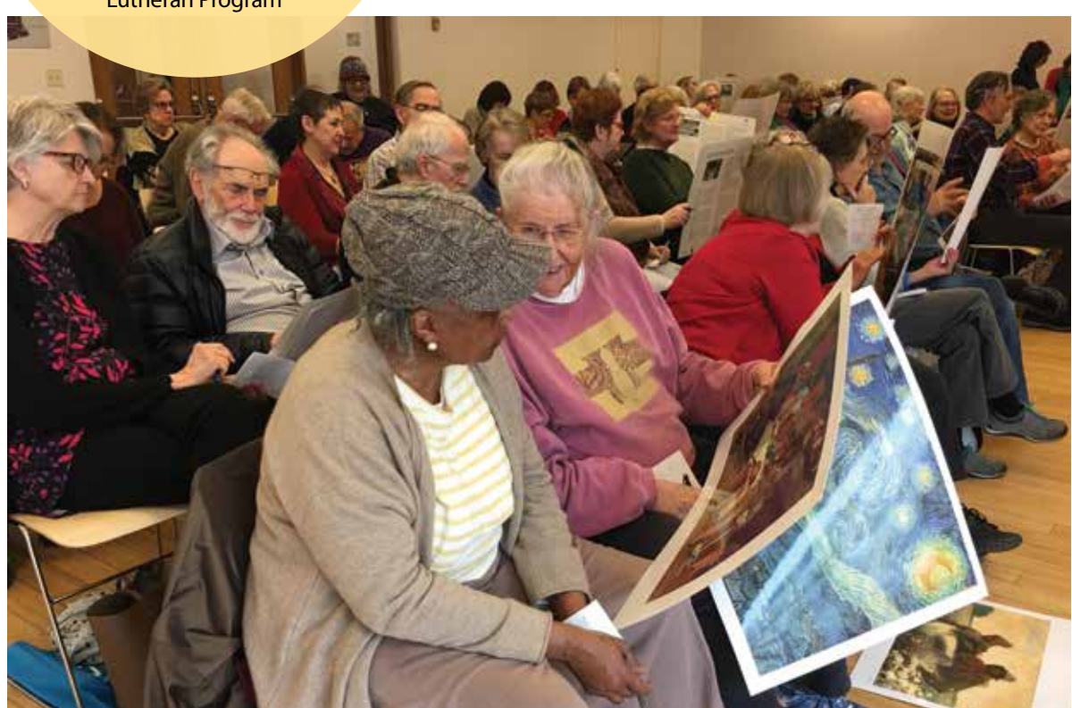
Learning how to look at art at one of our public events

Impact 1890 — a National Lutheran Program