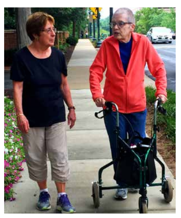
Escorted Walk to Do Some Errands. Volunteers support members' safety and independence.