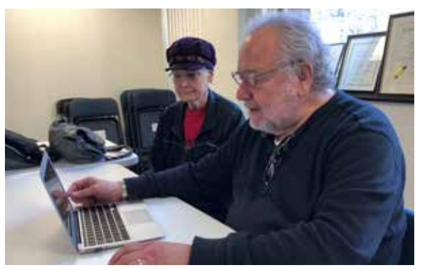
Problem Solving. Volunteers help with paperwork, digital files, and communications.

Silver Spring Village creates BONDS within and across DIVERSE neighborhoods.