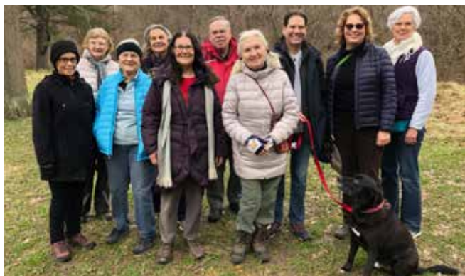
Members on a Walk in Rock Creek Park. Our programs help keep members active.