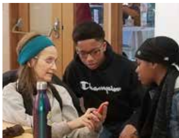
"Tech with Teens" on Martin Luther King, Jr. Day of Service. One of our projects to improve members' computer skills.

1,509 Phone Hours M-F, 10am to 4pm: volunteers handle member requests for service, information, and referrals for professional help