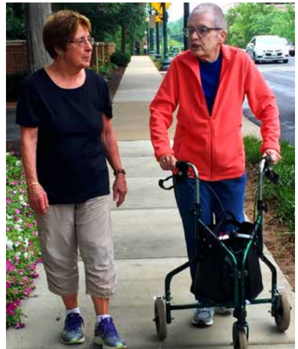
Escorted Walk to Do Some Errands. Volunteers support members' safety and independence.