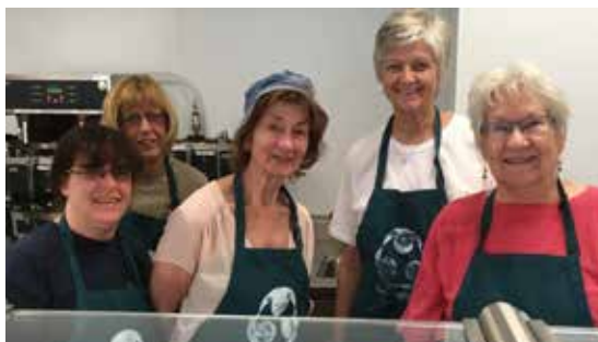
Members Volunteering at Shepherd's Table. One of the ways our members give back.