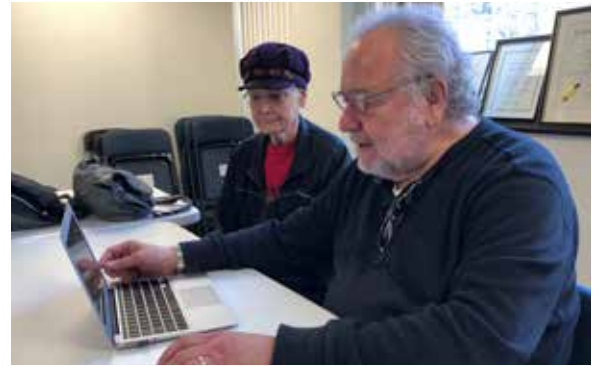
Problem Solving. Volunteers help with paperwork, digital files, and communications.

Silver Spring Village creates BONDS within and across DIVERSE neighborhoods.