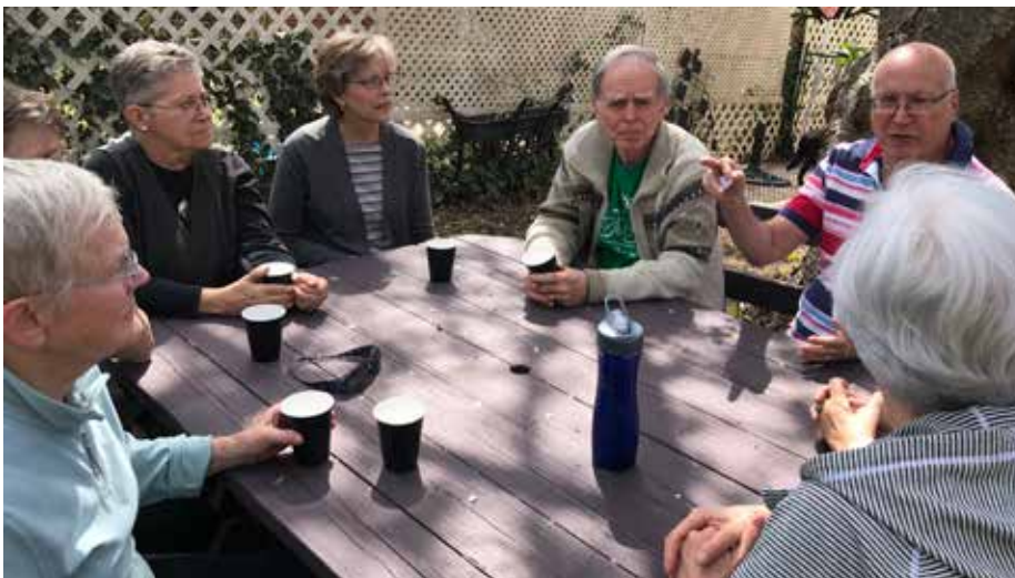
Getting-to-Know-You Group. Making new friends is a major benefit of Village life.